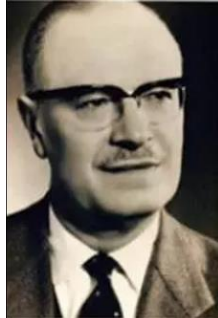
Florimond Volckaert February 23, 1898 - January 17, 1968

Volckaert's contribution was organizational rather than founding. He helped formalize Skål's structure, guided the creation of new clubs worldwide, and oversaw the organization's expansion after World War II. Because of this long leadership role, he is often considered one of the architects of Skål International's global growth. His leadership helped transform Skål from a small European club into the worldwide tourism organization it is today.